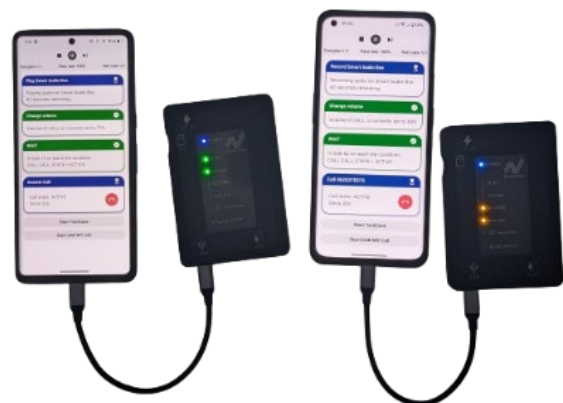
Figure 1. Audio MOS USB-C setup

Once the test is over, the SD card sends the files to the device which sends them to VWS. Thanks to the Smart Audio Box, easily automate your voice quality tests. Only two devices and two SAB are needed.